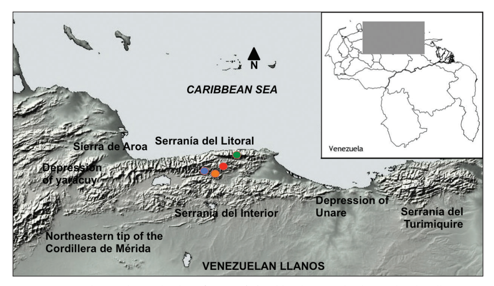
Figure 3. Map showing known localities for M. nebulosa : blue dot = Quebrada Honda, El Jarillo; orange dot = Cerro Azul, Los Teques; red dot = Altos Pipe; green dot = Massif du Naiguata.

tion here has trees with a canopy over 15 m high, such as Miconia sp. (Melastomataceae), Palicourea sp. (Rubiaceae), Clusia sp. (Clusiaceae), and Chusquea sp. (Poaceae) (pers. obs.). Several true cloud forest inhabitants (e.g. Evenus coronata (Hewitson, 1865) (Lycaenidae), Corades enyo enyo (Hewitson, 1849) (Nymphalidae) and Epiphile epicaste epicaste (Hewitson, 1857) (Nymphalidae) are also recorded here (pers. obs.). Thus, it is reasonable to expect that M. nebulosa can also be found in lower cloud forests on the slopes of the Cordillera de la Costa.