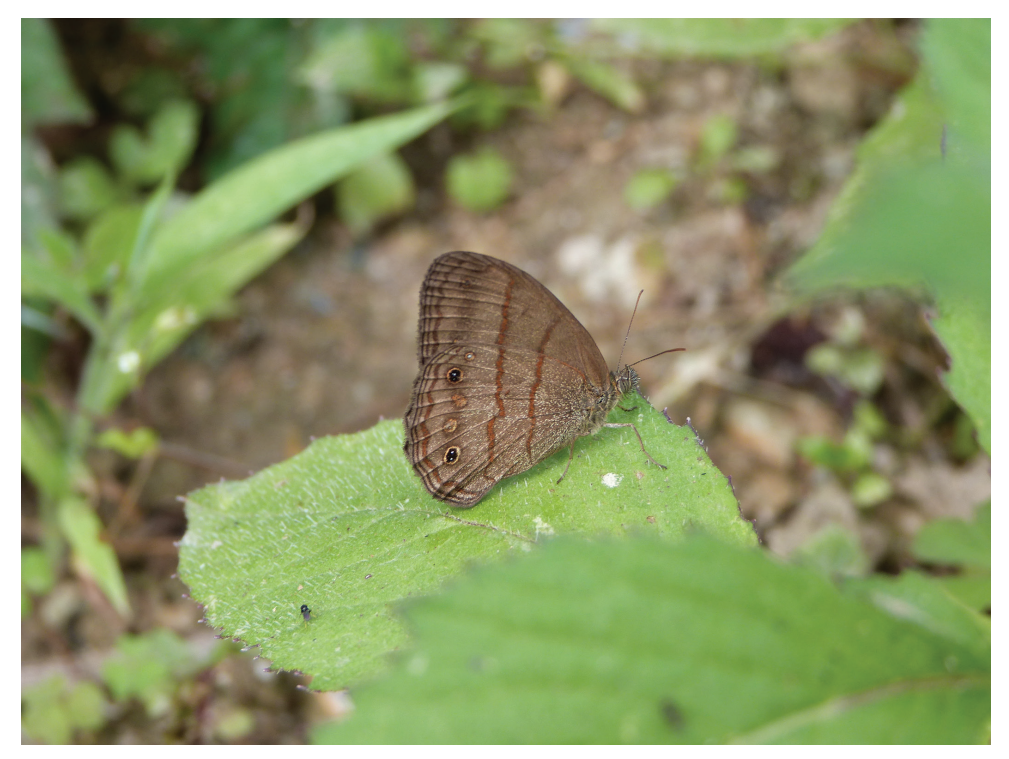
Figure 4. Magneuptychia nebulosa photographed in Quebrada Honda.

(Prittwitz, 1865)) also exhibits this curved postdiscal band. Magneuptychia nebulosa possesses a rather reddish discal and post discal bands. The number of white pupils in the five ventral hindwing subapical ocelli varies within M. alcinoe and is thus occasionally diagnostic; some specimens of M. alcinoe have only one pupil in one of the ocellus (K. Willmott, pers. comm.), whereas M. nebulosa always have two pupils in four ocelli, and one pupil in the larger, fifth ocellus. In addition, M. nebulosa may be confused with a variation of M. modesta (Butler, 1867), which is a species that seems to be very variable and is perhaps a complex of several species. However, M. nebulosa differs from this taxon by the combination of the undulating ventral hindwing postdiscal band and double-pupilled ocelli in ventral hindwing cell M1-M2 (usually one in M. modesta ).