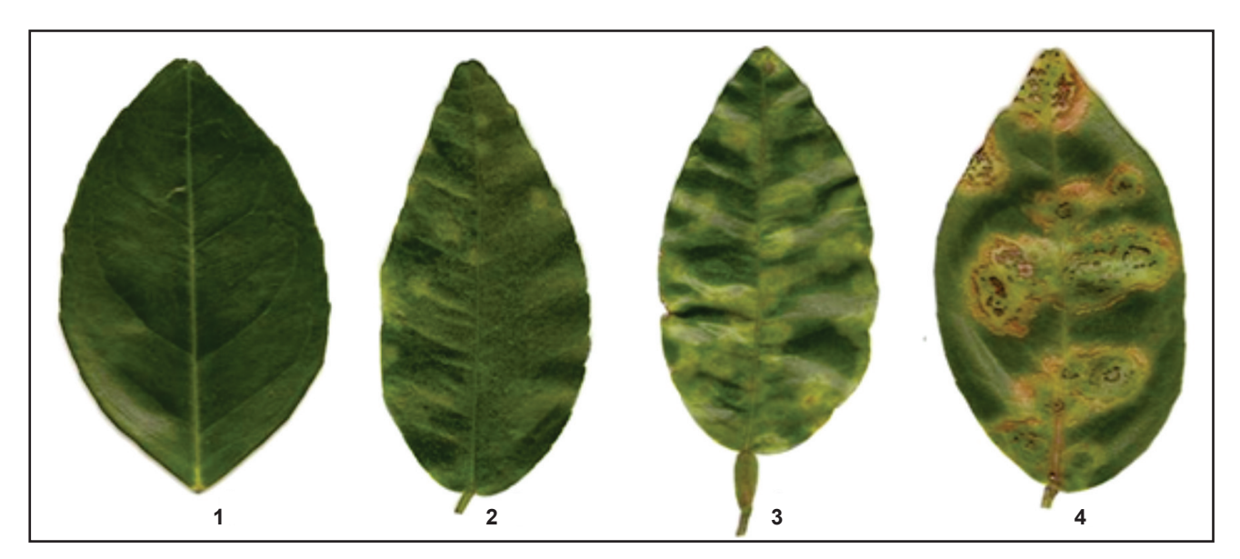
FIGURE 1 - Leaves from Pêra sweet orange infected by CiLV-C at different levels of disease development. 1 , Healthy; 2 , Young lesions (YL) ; 3 , Intermediary lesions (IL); 4 , Old lesions (OL).