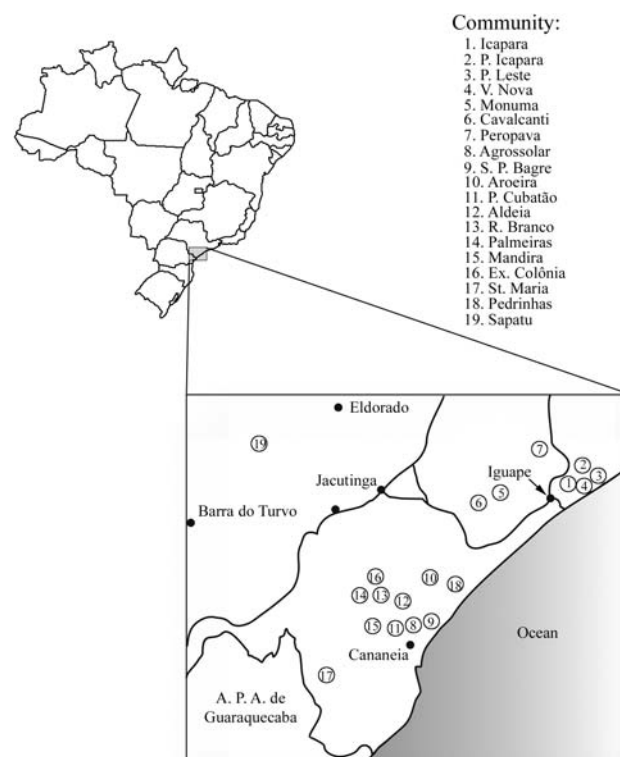
Figure 1 - Map of Brazil showing the 19 communities in the Vale do Ribeira in São Paulo state where the 78 sweet potato ( Ipomoea batatas ) accessions (landraces and putative clones) were collected.

The collection strategy consisted of visiting the households at random in the principal communities of the municipalities and applying semi-structured interviews based on questionnaires about the agricultural system and the crops currently grown. These interviews focused on the use, origin and location of the crop plantings and whether swidden, plots or home gardens were used (Bressan et al. , 2005). Each household provided one or more tubers or vines from each sweet potato variety and, on average, 1.8 sweet potato landraces were collected per household, distributed as follows: 16 households provided one landrace each, 11 provided two landraces each, three provided three landraces each, one (from Pontal de Icapara) provided four landraces and one (from Agrossolar) seven landraces. More than one vine or tuber was collected from landraces in the Iguape municipality and were considered replicates or clones (called clones in the text) for intravariety variability assessment. The accessions were initially multiplied in pots