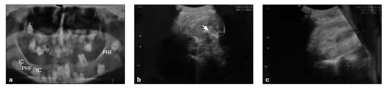
Fig 2 (a) Panoramic radiograph showing the presence of impacted permanent teeth with unusual location (L), intrapulpal calcifications in the molar crowns (IC), absence of the regular contrast between dentin and enamel, pericoronal hyperplastic follicles (PHC), and irregular alveolar ridge contour. Renal ultrasound revealed nephrolithiasis in the right kidney (arrow) (b), but not in the left one (c).