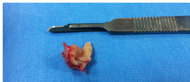
Figure 2. Remnant of the tooth and attached bone fragment.

During the postoperative period, a seven day course of Amoxicillin 500 milligrams every 8 hours and a Chlorhexidine Gluconate 0,12% mouthwash (twice per day) were prescribed together with adequate pain killers (paracetamol 500 milligrams every 6 hours). In addition, as a usual post extraction instruction, the patient was advised to avoid blowing his nose for two weeks to prevent the development of an oroantral fistula. The patient had an uneventful recovery and optimal opening of the mouth.