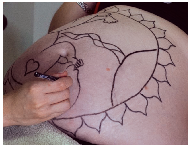
Figure 3 – Step 4 of the application of Art of Maternal Womb Painting

The length of stay of the painting is variable. The pregnant woman can remove it in the bath with soap and water. The drawing made with the eyeliner pencil comes out easily with the aid of a make-up remover. It was found in the research that most of the pregnant women wanted to spend more time with the art in their body, some remained more than a day with it (10) .