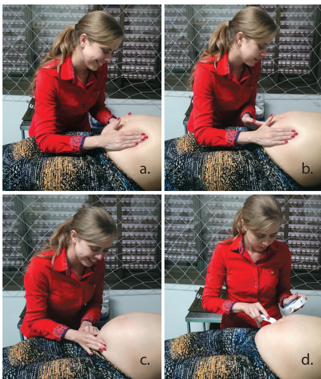
Figure 2 – Sequence of photos showing steps 2 (a. situation, b. position, c. presentation) and 3 (d. Auscultation of the FHRs) of the Art of Maternal Womb Painting, Campinas, São Paulo, Brazil, 2017